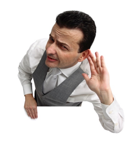
LEND AN EAR