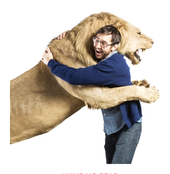
HAVE NO FEAR